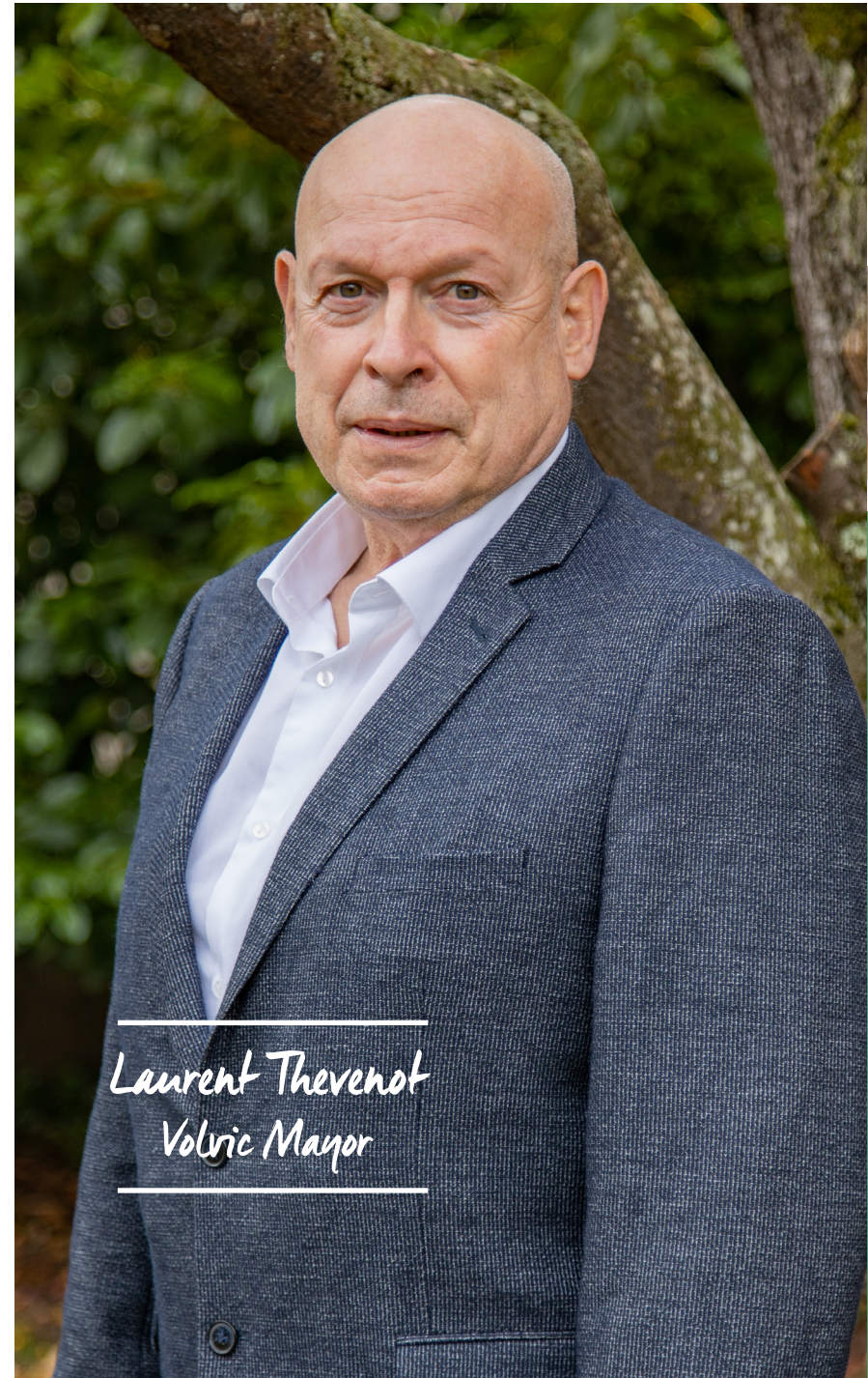
Laurent Thevenot Volvic Mayor

The agents of the township are already at work for the 2022 edition to be perfect .